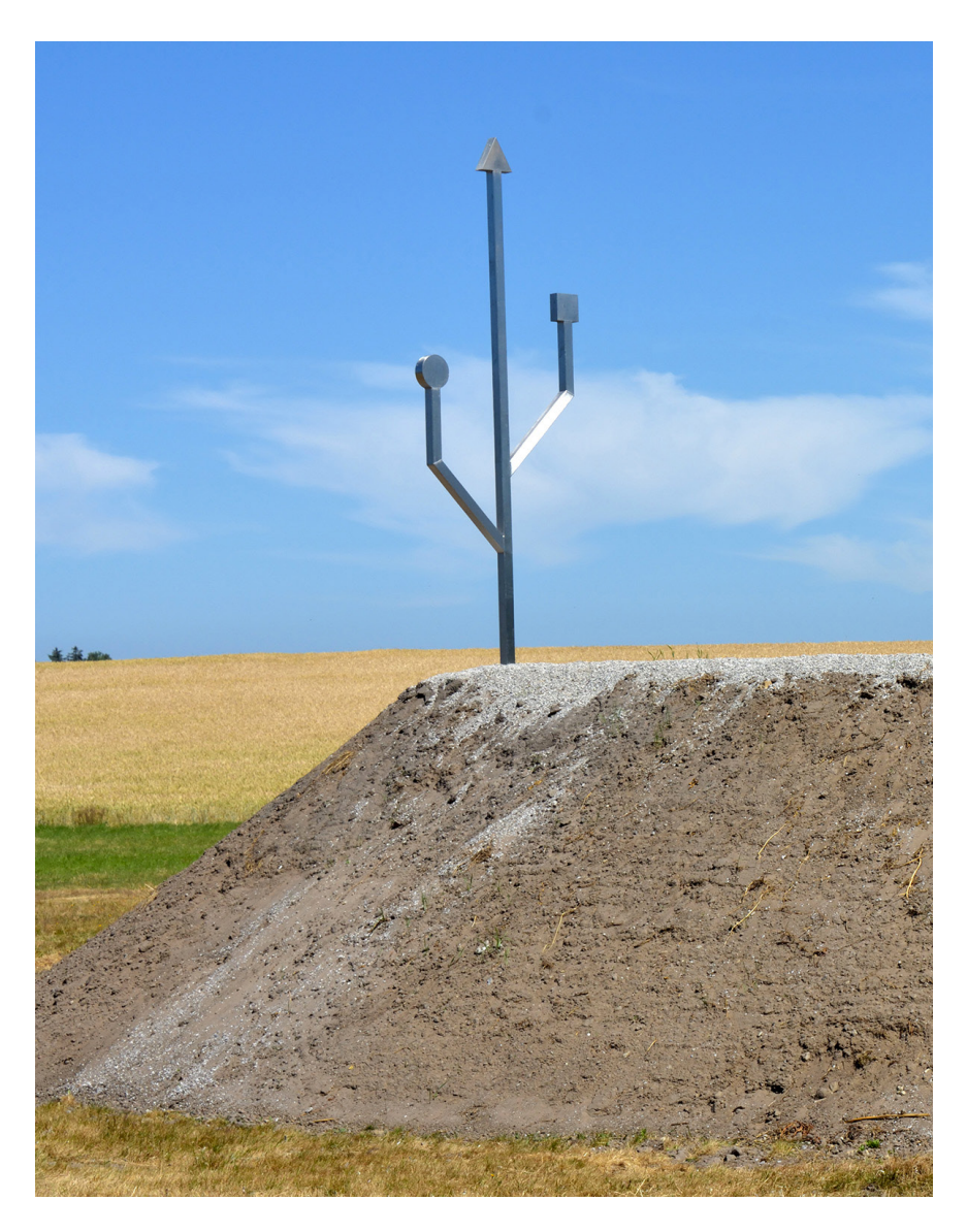
Ascent of the Mighty Trident, 2018

isolated to a sector, an organisation, group or specific technology. Like the USB, initiatives that drive the sustainable transition are not specific to one platform, technology, culture, or way of working. Dealing with the consequences of climate change is nuanced and it is about dealing with people, planet and prosperity. Individuals and communities provide energy and matter to the sustainable transition when people become patient leaders, when we become companions of the planet and when we collectively take ownership of the development process towards prosperity.